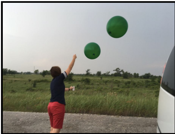
A Swarmsonde is released with two balloons attached to the sonde

When the sonde is released from the ground it is attached to two balloons instead of one. At a user-defined altitude, one balloon is cut off from the sonde. The balloon that still is attached to the sonde has enough helium to keep the sonde at the preferred altitude for a longer time. The sondes use a TDMA radio algorithm to share a single frequency, and data compression to transmit all data over a long-range radio. Swarmsonde is based on the miniature radiosonde Windsond.